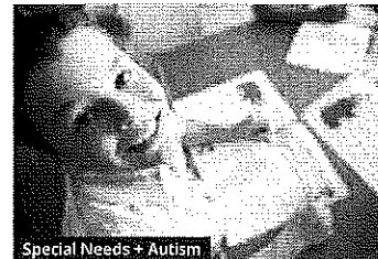
Special Needs + Autism Building Bridges Therapy Center